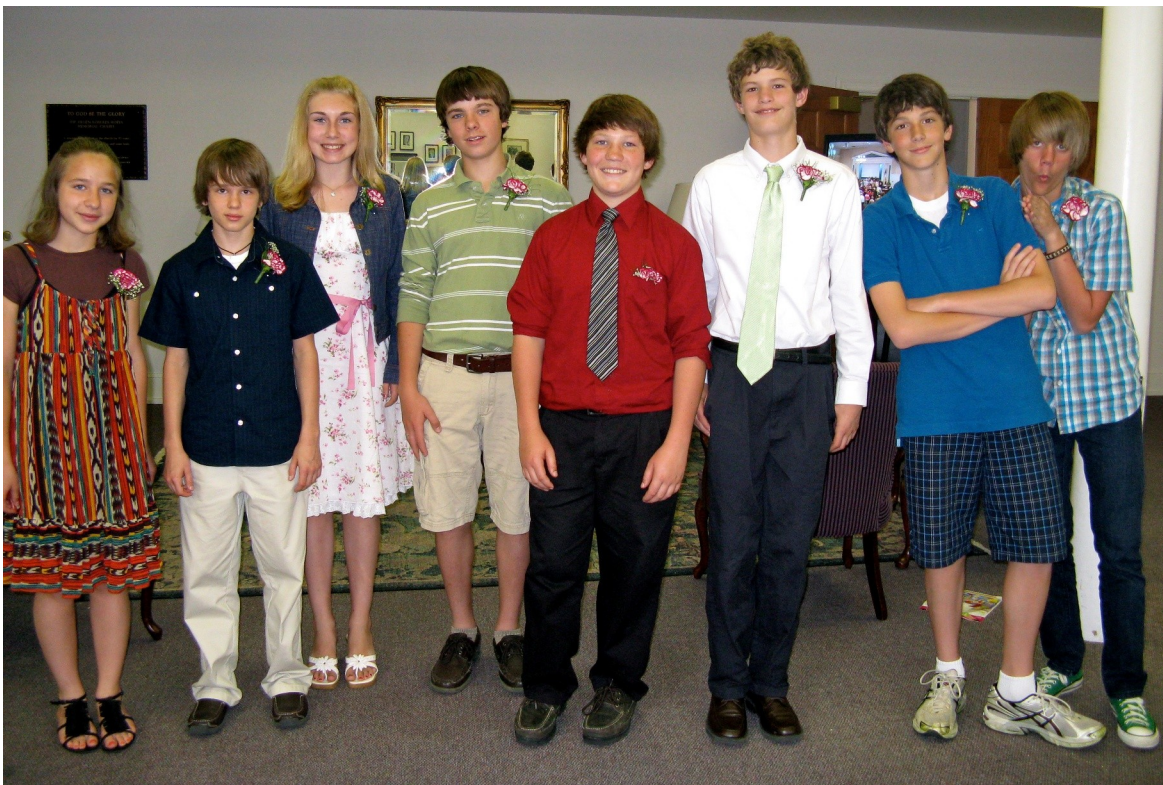
The Communicants Class for 2009: