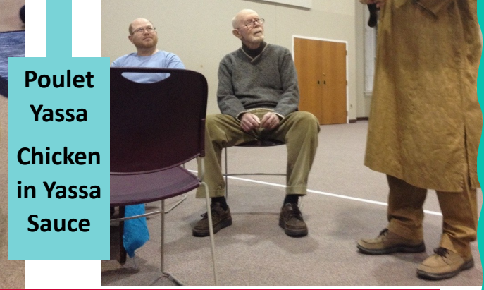
Poulet Yassa Chicken in Yassa Sauce